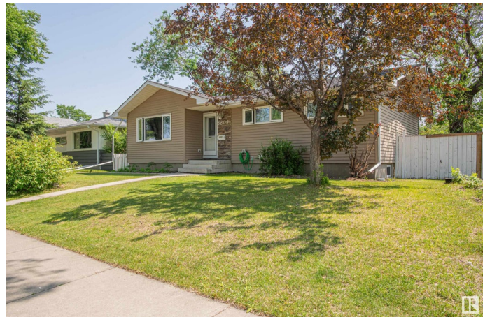
8803 160 St NW, Edmonton, AB